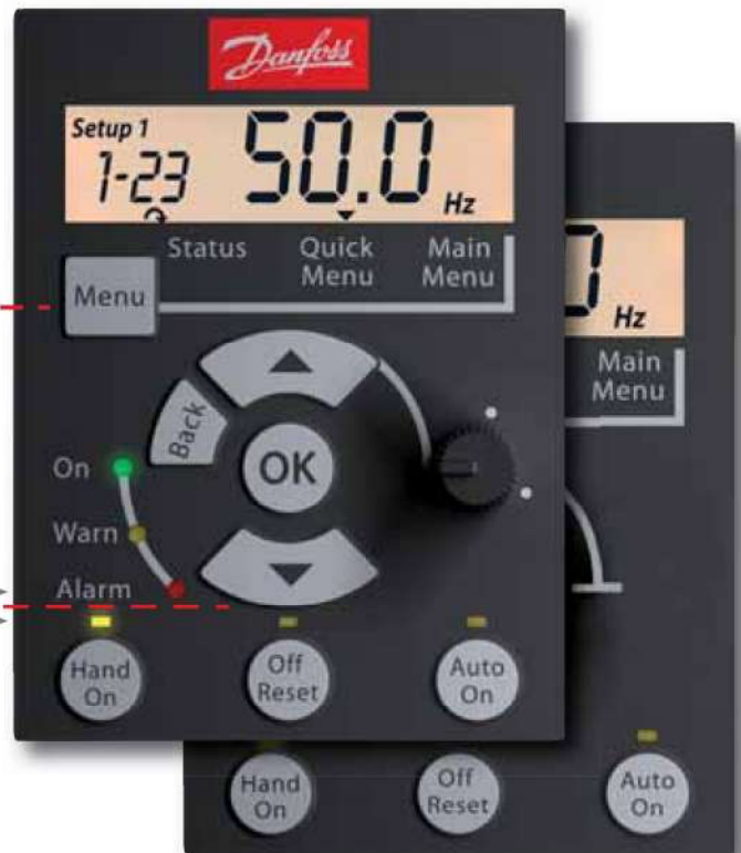
Two control panel versions. Potentiometer is optional.